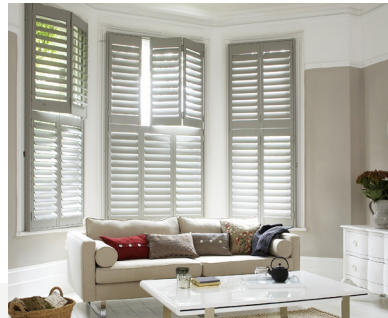
Indoor Plantation Shutters