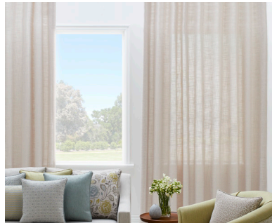
Curtains & Sheers